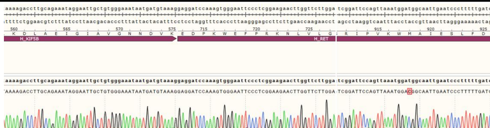
Figure 2 | The KIF5B-RET mutation analysis by Sanger sequencing.